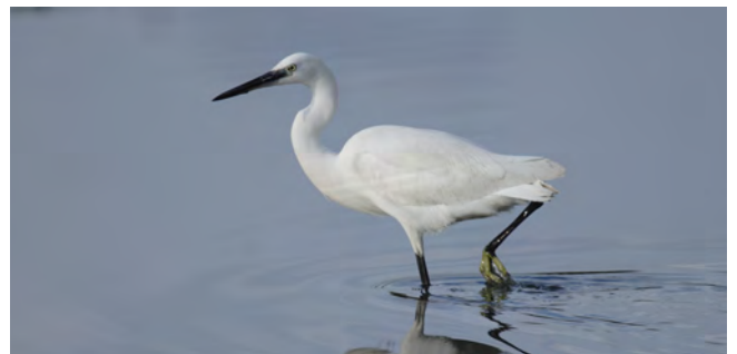
Little Egret - Egretta garzetta