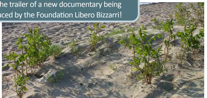
Liquorice - Glycyrrhiza glabra

Look for the Sentina Reserve on You tube! You will find the trailer of a new documentary being produced by the Foundation Libero Bizzarri!